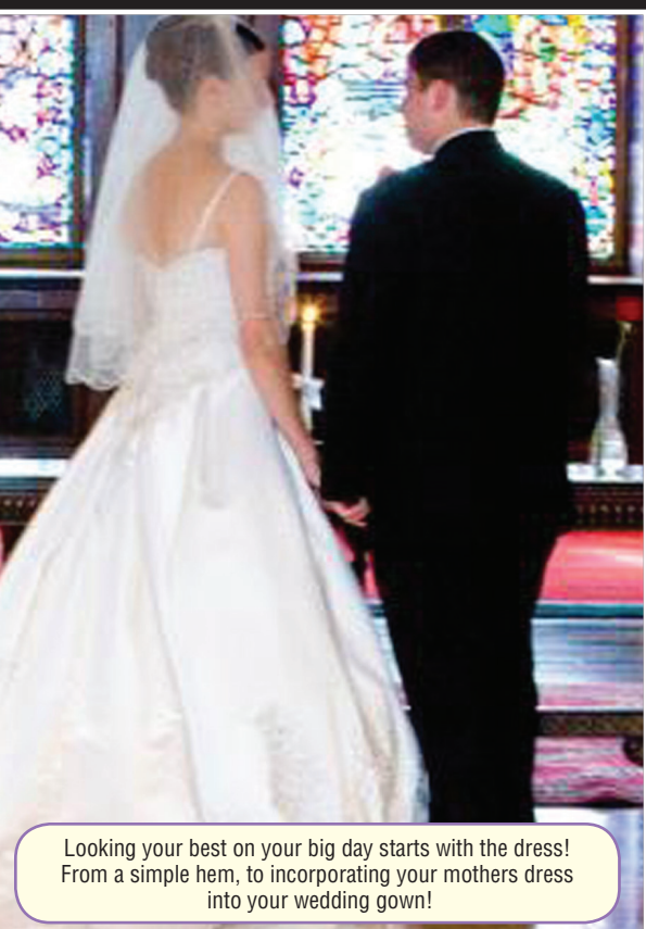
Looking your best on your big day starts with the dress! From a simple hem, to incorporating your mothers dress into your wedding gown!

...She specializes in formal & evening attire as well as everyday wear, suits, jackets, skirts, slacks and custom designs.