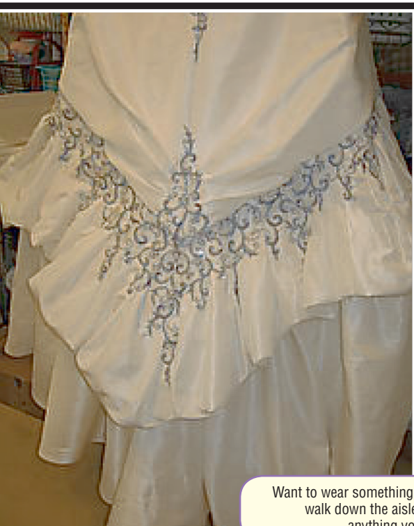
Want to wear something completely unique when you walk down the aisle? We are able to create anything you can dream of!

Worried that the unthinkable could happen to your dress? This service involves Dianne herself showing up at your wedding 2-hours early before you have any pictures taken with her "Bag of Tricks" to double check your gown and help you look your best on your BIG day!