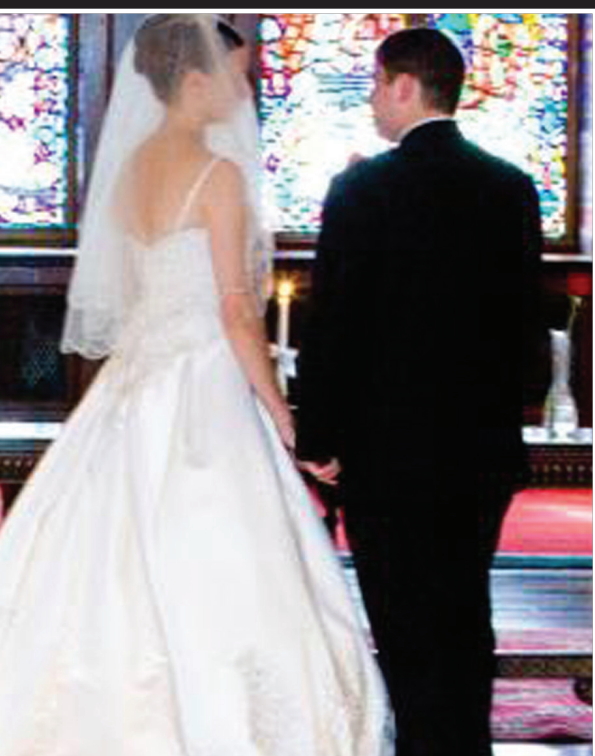
Looking your best on your big day starts with the dress! From a simple hem, to incorporating your mothers dress into your wedding gown!

...She specializes in formal & evening attire as well as everyday wear, suits, jackets, skirts, slacks and custom designs.